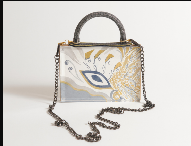
My eyes are on you handbag Mixed Media 20cm x 18cm