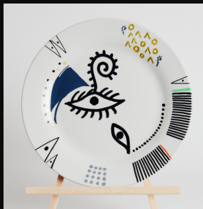
Plate 3 Dinner With Abstraction Mixed Media 10cm x 26cm