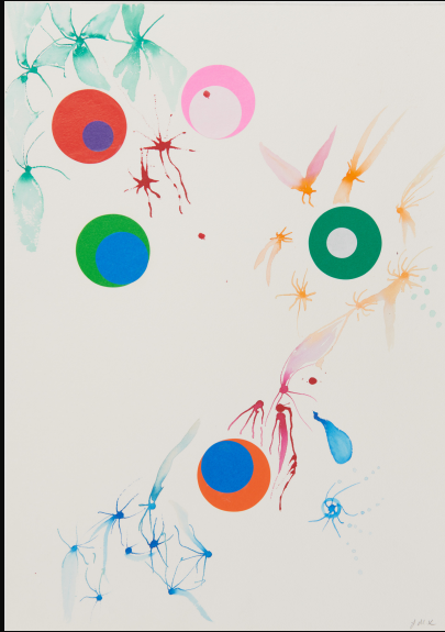
Crossing the Empyrean IV Mixed media on arches paper 42cm x 60cm