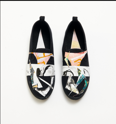
BOTTOM LEFT Shoes - Set II Mixed Media 10cm x 26cm