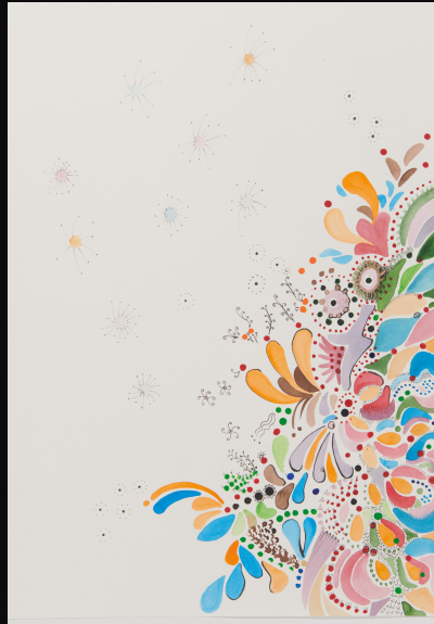
Crossing the Empyrean V Mixed media on arches paper 42cm x 60cm