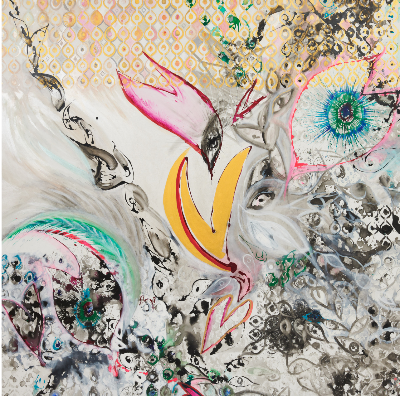
Looking for Lee Krasner Mixed Media 201cm x 199cm