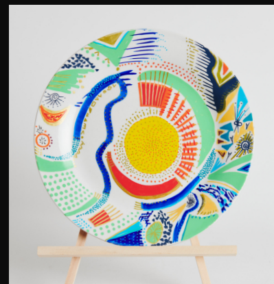
Plate 6 Dinner With Abstraction Mixed Media 10cm x 26cm