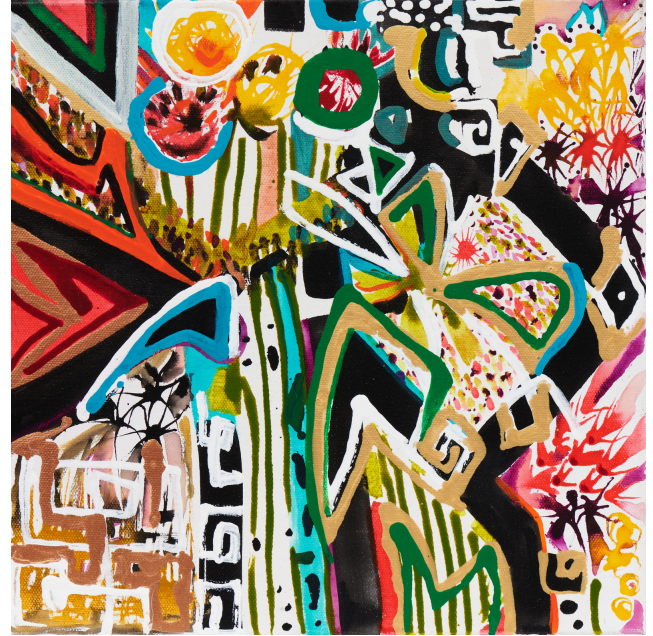
Continuance Oil and Acrylic on Canvas 30cm x 30cm