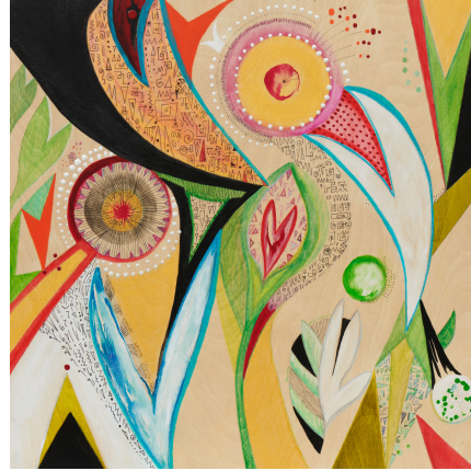
Antecedent Pollination Panel II of Triptych Mixed Media on Birch Panels 51cm x 51 cm