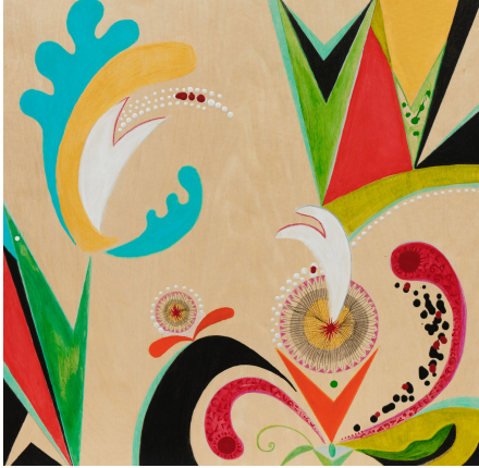
Antecedent Pollination Panel I of Triptych Mixed Media on Birch Panels 51cm x 51 cm