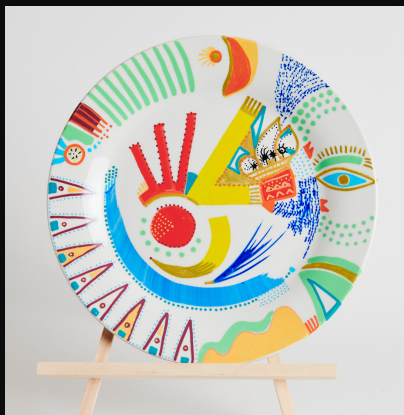
Plate 7 - Dinner With Abstraction Mixed Media 10cm x 26cm