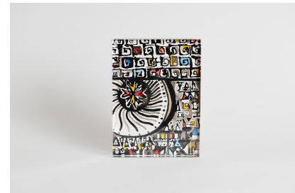
Letterbox I 3 stacked perspex blocks in metallic postbox, with front and back sides. Watercolour on arches paper 1060cm x 23cm