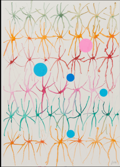
Crossing the Empyrean I Mixed media on arches paper 42cm x 60cm