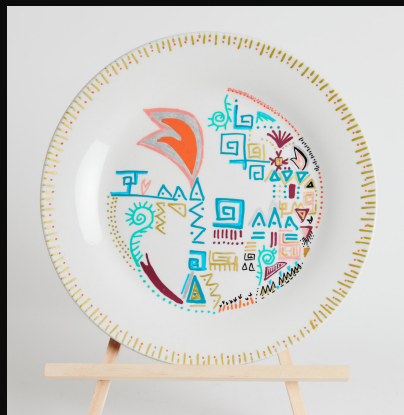
Plate 9 - Dinner With Abstraction Mixed Media 10cm x 26cm