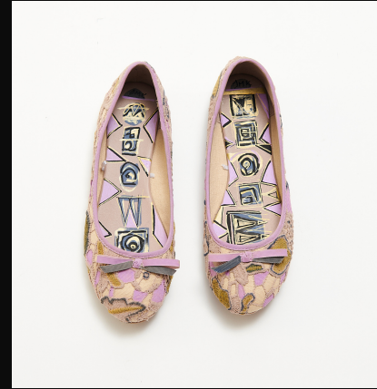
TOP RIGHT Shoes - Set V Mixed Media 10cm x 26cm