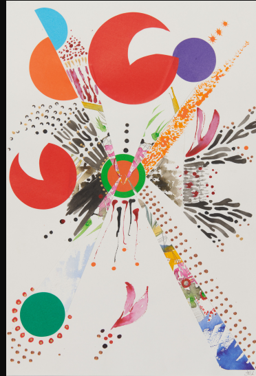
TOP RIGHT Inspirational Stardust II Watercolour, acrylic and coloured paper 42cm x 60cm