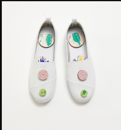
BOTTOM MIDDLE Shoes - Set IV Mixed Media 10cm x 26cm