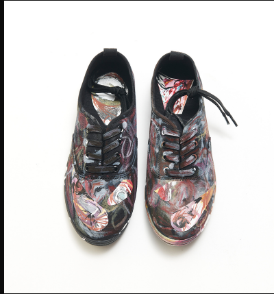
TOP MIDDLE Shoes - Set III Mixed Media 10cm x 26cm