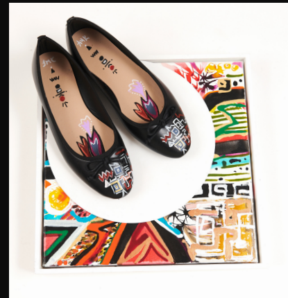
BOTTOM RIGHT Shoes - Set VI Mixed Media 10cm x 26cm