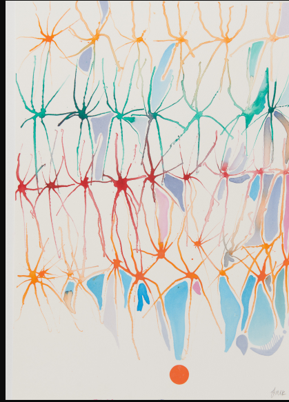
Crossing the Empyrean II Mixed media on arches paper 42cm x 60cm