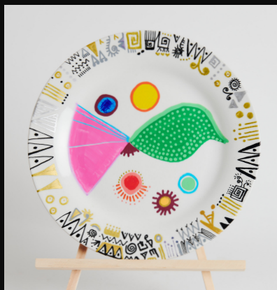
Plate 4 Dinner With Abstraction Mixed Media 10cm x 26cm