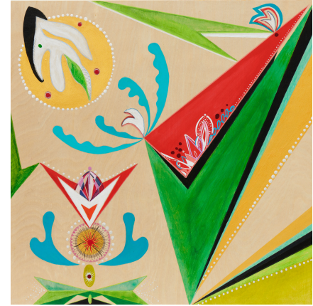
Antecedent Pollination Panel III of Triptych Mixed Media on Birch Panels 51cm x 51 cm