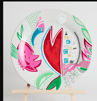
Plate 5 Dinner With Abstraction Mixed Media 10cm x 26cm