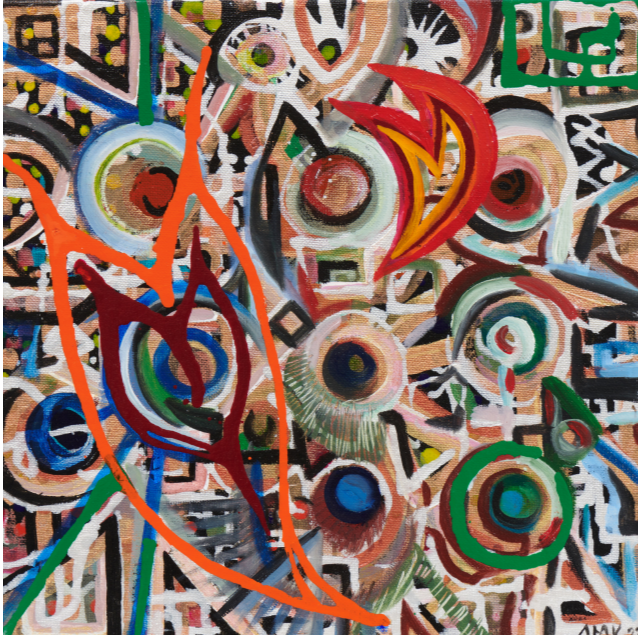
My Letter No.2 Stamped With Love Oil and Acrylic on Canvas 30cm x 30cm