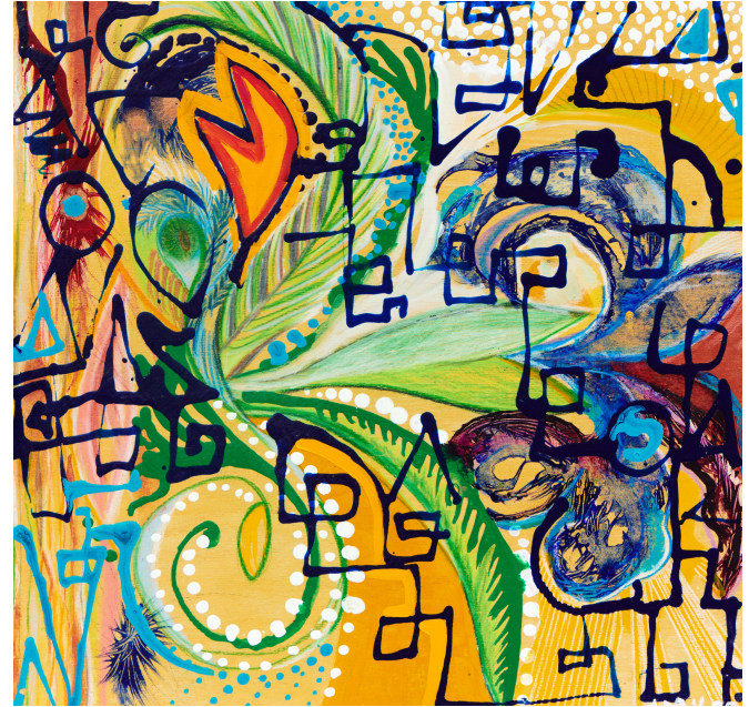
Momentum Mixed Media on board, acrylic, watercolour, inks, pen 30cm x 30cm