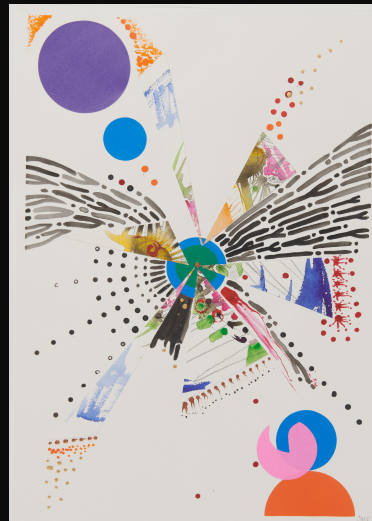
BOTTOM RIGHT Inspirational Stardust IV Watercolour, acrylic and coloured paper 42cm x 60cm