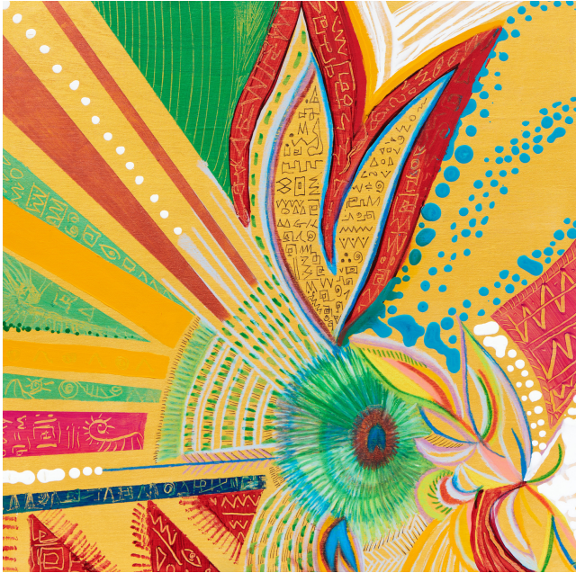
Incredible Things Happen When You Look Into Someone Else's Eyes Mixed Media, coloured pencils, inks, acrylic 30cm x 30cm