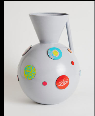
Let's Drink to Abstraction Jug - Mixed Media 30cm x 25cm