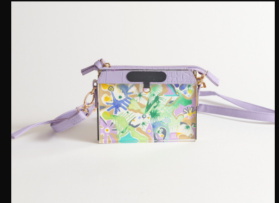
Sprinkle some Stardust on Me handbag Mixed Media 11cm x 15cm