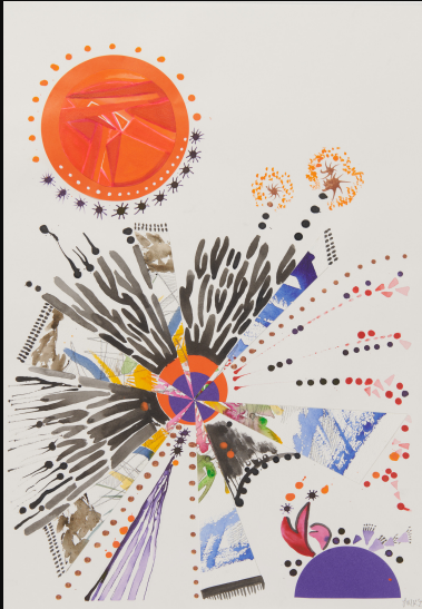
TOP LEFT Inspirational Stardust I Watercolour, acrylic and coloured paper 42cm x 60cm