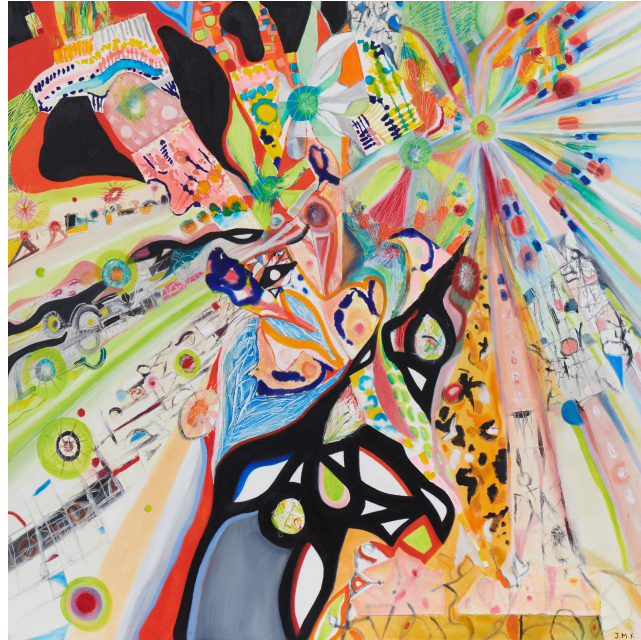
Mysterious Conversation III - Thanks, You Are Right... I Need to Explore My Artistic Self! From the series Familial Hieroglyphics Mixed Media 102cm x 102cm