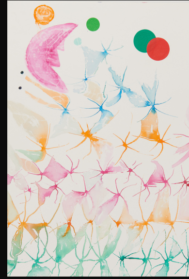
Crossing the Empyrean IV Mixed media on arches paper 42cm x 60cm