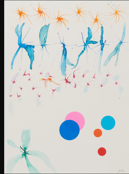
Crossing the Empyrean III Mixed media on arches paper 42cm x 60cm