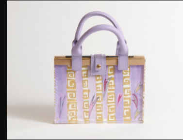
I'm Loving the Hieroglyphs handbag Mixed Media 19.5cm x 25cm