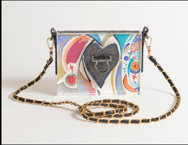
You touch my heart handbag Mixed Media 12cm x 15cm