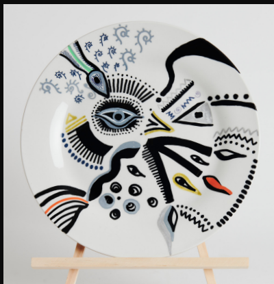
Plate 1 Dinner With Abstraction Mixed Media 10cm x 26cm