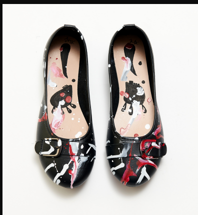
TOP LEFT Shoes – Set VII Mixed Media 10cm x 26cm