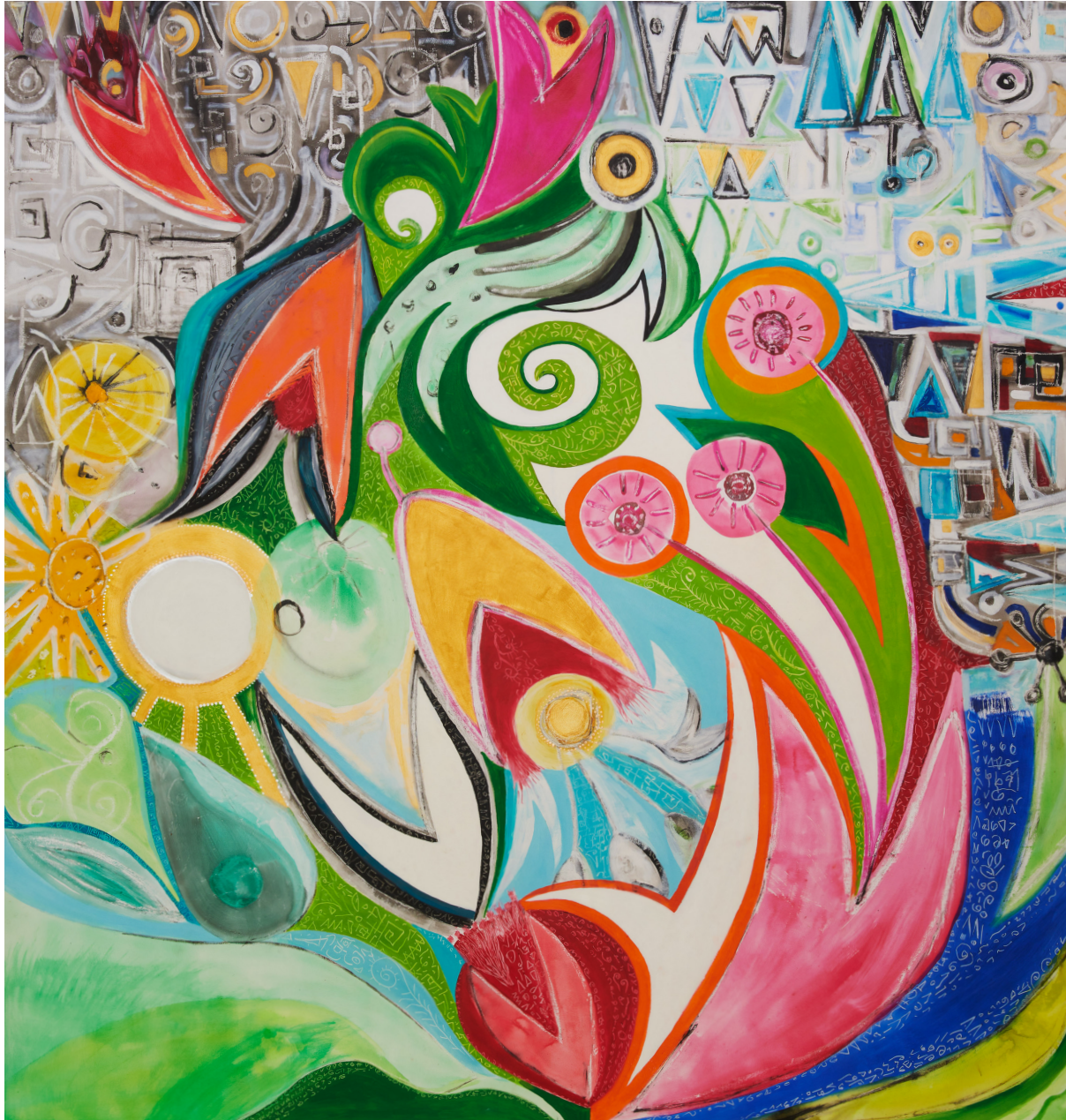
FRONT COVER: Is Love the Great Universal Pollinator? Mixed Media 202cm x 190cm