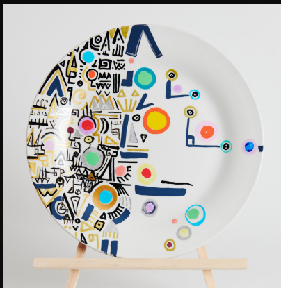
Plate 8 - Dinner With Abstraction Mixed Media 10cm x 26cm