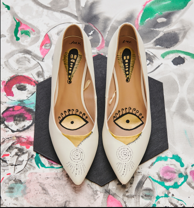
TOP LEFT Shoes- Set I Mixed Media 10cm x 26cm