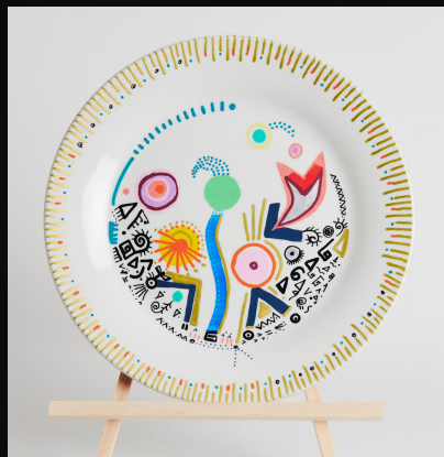
Plate 10 - Dinner With Abstraction Mixed Media 10cm x 26cm